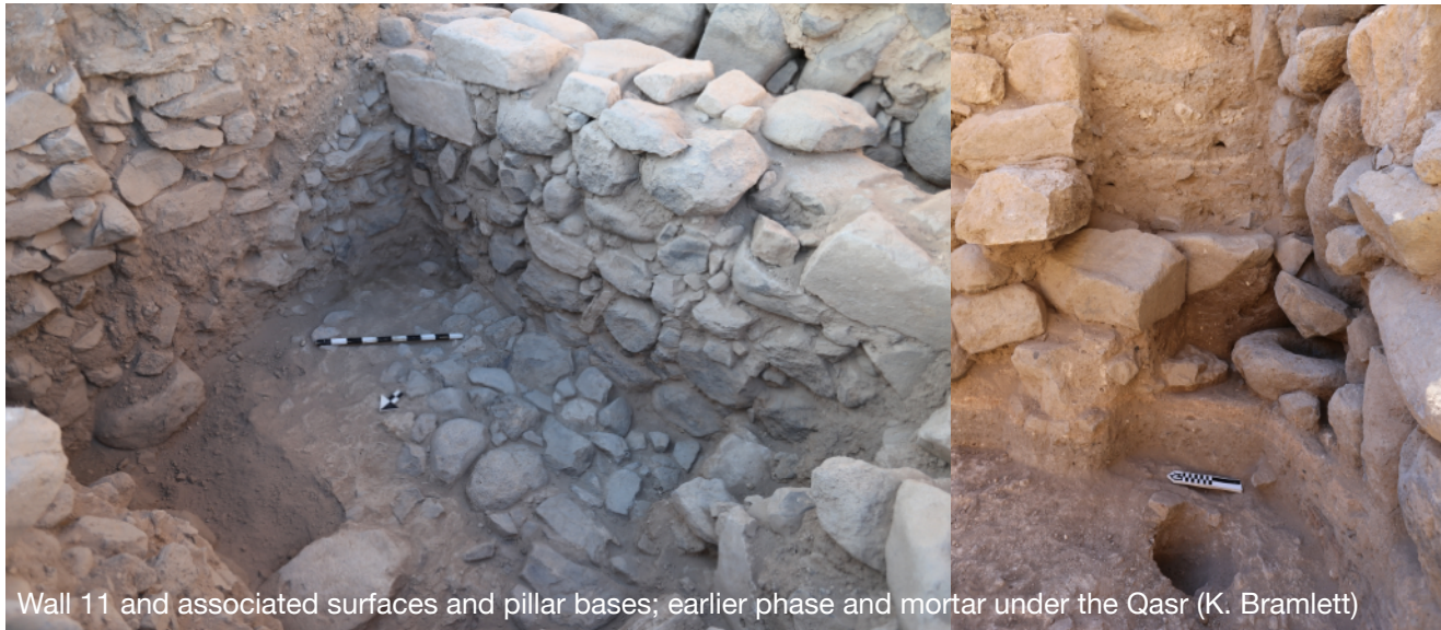
Wall 11 and associated surfaces and pillar bases; earlier phase and mortar under the Qasr (K. Bramlett)

The latest Iron II phase is represented by Wall 6, which is at the north edge of the probe. This wall was associated with a beaten-earth surface that had a large Iron 2C pithos buried in it (see BRAP Beat 2.1). The pithos was complete but cracked. This was likely part of a domestic structure. An earlier Iron II phase is represented by Wall 11, which went deeper than Wall 6 and was associated with a cobbled floor, a separate beaten earth surface, and possible pillar bases. The complex appears to date to the early part of the Iron II.