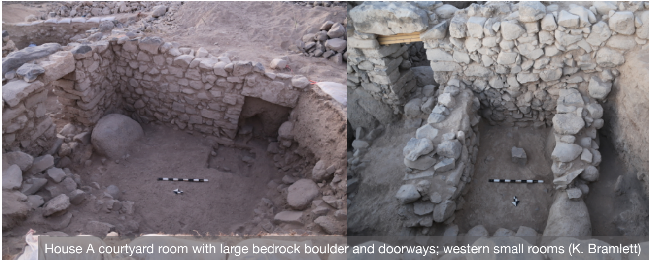
House A courtyard room with large bedrock boulder and doorways; western small rooms

A total of seven rooms were excavated in House A this season, all excavations reaching an Iron Age II floor level. This was the Phase II floor found in both the 2012 and 2017 seasons. The architecture of House A, which is not completely known, consists of a number of well-constructed and well-preserved stone walls. Three doors between rooms were found preserved with intact door lintels, revealing that likely the entire first story of the house is preserved. Given the thickness of the walls, all two rows wide, and the presence of stone courses found preserved on top of the intact doorways, it is highly likely that this house was originally two stories high. The finds above the house floors included a large amount of pottery and bone, groundstone tools, beads, figurine fragments, spindle whorls, loom weights, fragments of bronze and iron objects, two complete bowls and a juglet, and many jar stoppers.