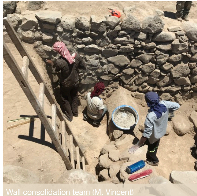
Wall consolidation team (M. Vincent)

Previously, excavation areas were backfilled with over a meter of sifted earth to try and preserve excavated features after the season's end. This was unsuccessful and led to considerable disturbance of the archaeological record. At the end of this season we hired a team of local wall consolidators to add a modern mortar to the standing architecture of House A to hopefully preserve it for future excavation.