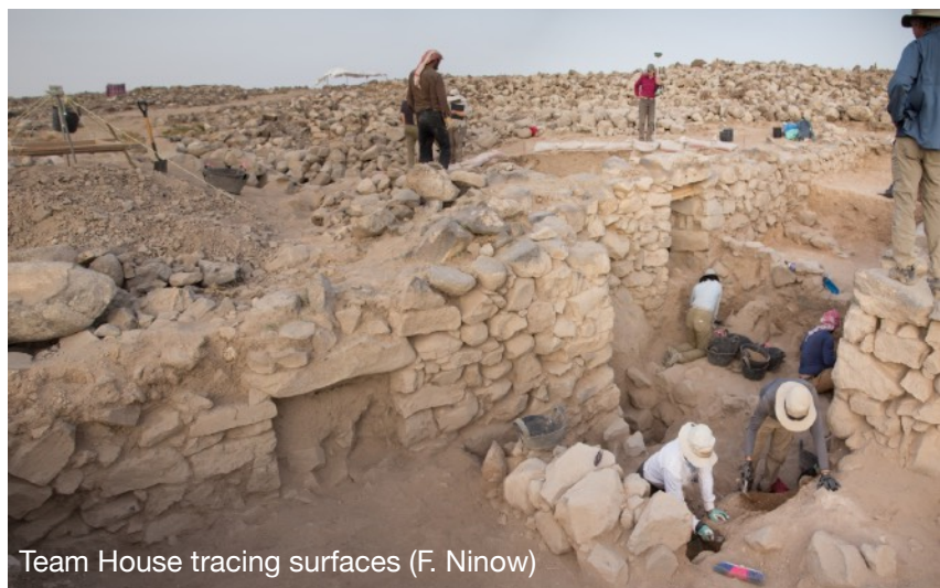
Team House tracing surfaces (F. Ninow)

Excavation centered on a single large structure, now named House A, which was previously excavated in 2012 and 2017. These earlier excavations proved the building was in fact a domestic structure, with two phases of floors and walls. The house area was reopened this season with the goal of opening a larger horizontal exposure of the house, with the intention of learning more about domestic architecture at the site during the Iron Age.