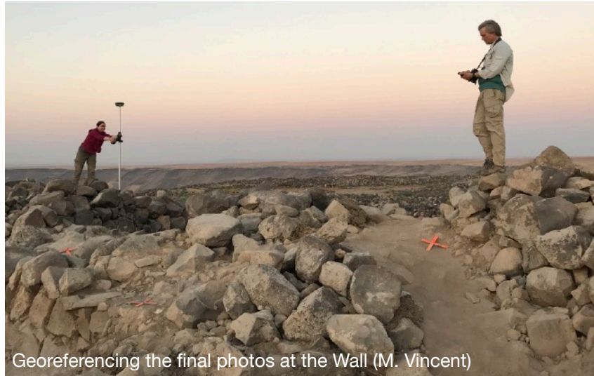
Georeferencing the final photos at the Wall (M. Vincent)

GPS coordinates were taken within excavation areas for artifacts found in situ , locus elevations, and samples including soil, charcoal, lithic, and pottery for residue testing. As part of daily and final photography, we are in the process of creating photogrammetry models of each excavation area. These are then georeferenced for accuracy and can then be used in further study, for measurement, and the drawing of top plans and balks.