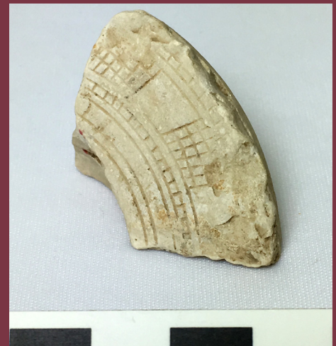
Cosmetic Palette #701

In 2018, fragment #701 was selected as part of a group of potential cosmetic tools to begin the journey of organic residue analyses. The first stop was the University of Riverside, California, in the Chemical Analysis Facility, for SEM-EDS (scanning electronic microscope, with electronic dispersive spectrometry). The scan determines whether or not there is material that appears separate from the background reading of the stone and to give a starting point for those data. In the case of #701, the SEM-EDS clearly showed a high concentration of Carbon, which we felt could be fat of some sort that would’ve been used in a cosmetic compound. Subsequent testing with additional methods confirmed this suspicion. Fragment #701 makes a trip back across town to the La Sierra University Chemistry lab, where it will undergo GCMS (gas chromatography with mass spectrometry) analysis by Dr. Jennifer Helbley and chemistry student Amanda Oronoz. This time the results show a number of fatty acids, steroids, and other likely elements of animal fat.