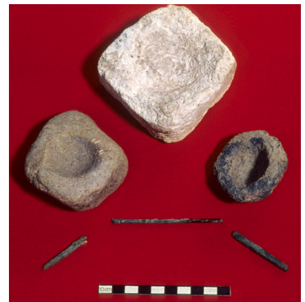
Cosmetic palettes and tools from Tall al-'Umayri, 1984 season.

bone spatulas seem to appear in varied thicknesses. Adams hypothesizes that the thicker spatulas would have been best for cosmetic mixing and application while the thinner spatulas were better used as weaving instruments. The rounded ends easily crushed minerals such as mica, malachite and quartz in tests, whereas the pointed ends of the spatula made eye makeup application easy.