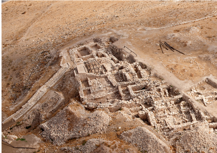
Tall al Umayri

The negative consequence of failing with this undertaking is that the sites that have provided such rich sources of countless stories from the past will themselves become obliterated. If this happens, opportunities for growing tourism and thus local sources of income will vanish as well. In places such as Jordan, where tourism relies heavily on taking visitors to see and learn about archaeology and archaeological sites, the effect will be devastating to the local economy. While this may be a secondary benefit, it is essential for the major benefit of preserving the sites.