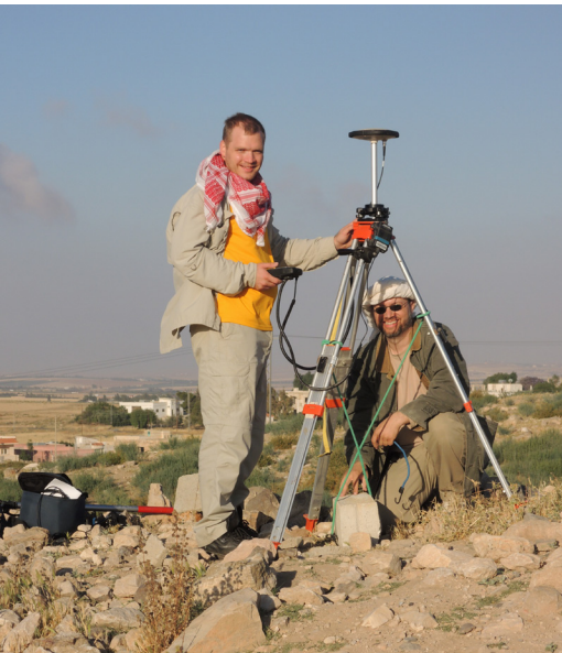
Tall Jalul

university professors and graduate students as well as lay persons with a special interest in the cultures and peoples of this region.